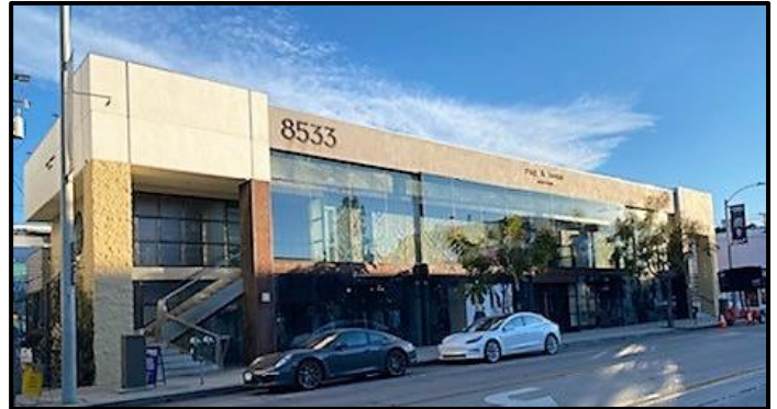
Rag & Bone